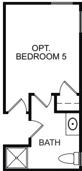
OPT. FIFTH BEDROOM